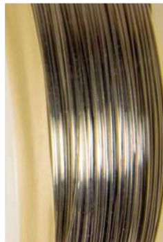
Soft Stainless Steel (Simil Monel)